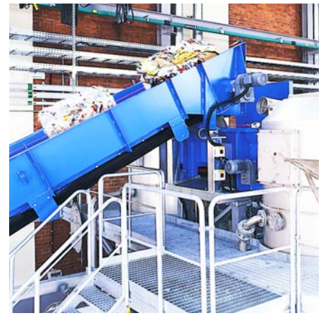
Feeding waste paper or pulp to LC-, MC-, or HC pulper.

Modern process control gives our trial facilities the flexibility to precisely monitor, easily change parameters and document the process results.