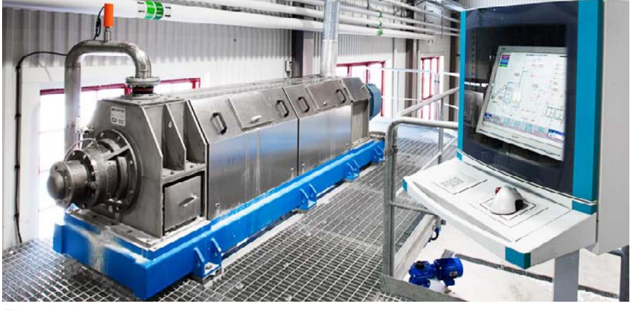
Thickening by screw press.