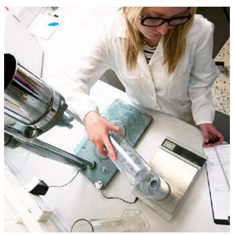
Fibre suspensions and paper samples are examined in our laboratory.