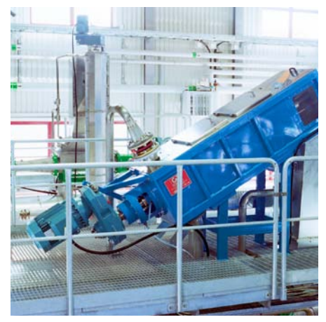
Thickening by inclined screw dewatering.