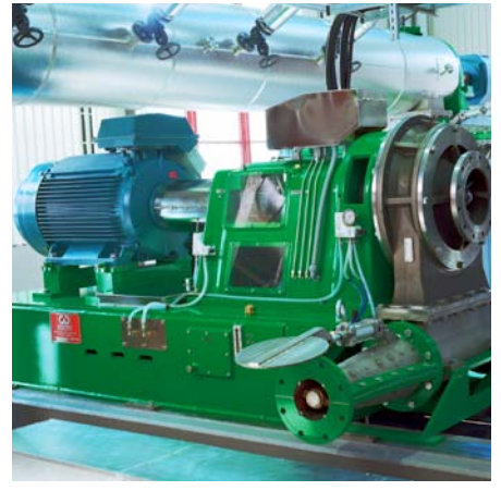
MC- and HC Refining.