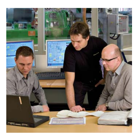
When running customer trials all operating parameters and process variations are agreed with the customer who is supervised the test.